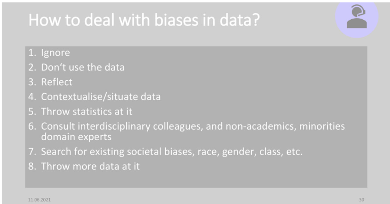
Figure 3. Suggestions for how to deal with biases in data.

the data sets by themselves: some decided to take out “big” nodes in their Gephi visualisations to see how that would change the relations between other nodes – accounting for making hierarchies in data appear in a different light. Others suggested it needed more data to make their initial findings more sound, or one suggested that it needed domain experts to interpret the data they had visualised.