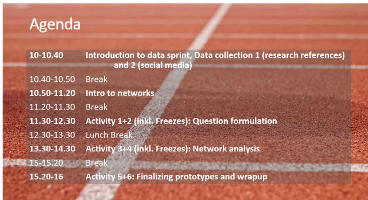
Figure 1. Structure of the data sprint (as shown to participants, original slide deck)

made use of the “sprint” metaphor (with both the background and the “freezes”). The exact time slots were adopted during the sprint.