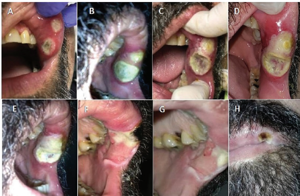
Fig. 1: Evolution of the oral ulcerations on the jugal mucosa. A) Clinical aspect on the first stomatological consultation. B) 48 h of evolution showing increased size and almost confluent lesions. C) 10 days of evolution. Detached necrotic layer has been removed. D) Oral lesions aspect when systemic metronidazole treatment was started. E-H) Healing process with marked improvement of clinical aspect of lesions.

Periodontal prophylaxis was performed to remove the bacterial load of the oral cavity to avoid worsening of the lesions. Further indication was local miconazole 2% four times/day and mouthwash with chlorhexidine 20% twice a day. An interconsultation was performed with the attending physician who augmented dosage of valganciclovir and requested viral load for CMV, EBV, herpes simplex virus (HSV) and varicella-zoster virus (VZV). Forty-eight hours after the first stomatological appointment, no improvement of the lesions was obtained. Conversely, an increase in the size of both lesions was observed with more edematous surrounding tissue (Fig. 1B). The patient complained about the appearance of a fetid smell from the lesions. A superinfection with anaerobic bacteria was suspected and topical treatment with metronidazole 1% was added. Eight days after the first appointment, the necrotic layer turned to a greenish color and was detached from the lesion. PCR analysis reports for HSV, VZV and CMV resulted negative; therefore, the dosage of valganciclovir was reduced to prophylaxis as previously.