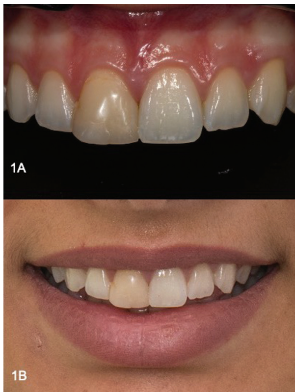
Fig. 1: Initial Situation A) Close up, B) Smile.

lance was performed by clicking with the special tool of the software to the part of the gray reference card (White balance, Emulation, Freiburg, Germany), under the right central incisor (Fig. 1). To carry out exposure balance,