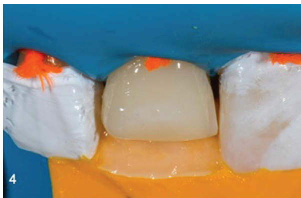
Fig. 4: Application of a lingual layer of enamel.

Line angels of both central incisors were highlighted using a mechanical pencil. Finishing of the restoration was accomplished, using coarse and medium disks (Sof-Lex 3M ESPE) , a low speed flame diamond bur (831 204 012, Komet, Lemgo, Germany) for smoothing and shape configuration, a #12 surgical blade (Swan-Morton, Sheffield, UK) for removing excess in proximal areas, a fine multi-blade carbide bur for fine adjustments in labial surface (H48LUF 314 012, Komet) and a high speed medium grit diamond football bur (8379 314 021, Komet), for palatal occlusal adjust-