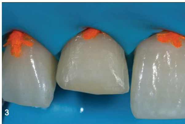
Fig. 3: After the remove of old restoration .

DR, Zug, Switzerland) and seated, with finger pressure (Fig. 4). After light curing the PVS matrix and Teflon tape were removed. A sectional metal contoured matrix was placed to restore the interproximal walls and contacts (TorVm, Moscow, Russian). Dentin shade (i1 Body, In Spiro, EdelweissDR) was shaped extending from the middle of the bevel area to the incisal edge, forming incisal edge inner anatomy. In order to determine the thickness of residual buccal enamel, according to our initial color measurements, a special caliper (TNFF7/8, Chicago, Hu Friedy) was used (Fig. 5). Finally, an enamel layer of 0.9mm thickness was applied, extending from the beveled areas to the incisal edge.