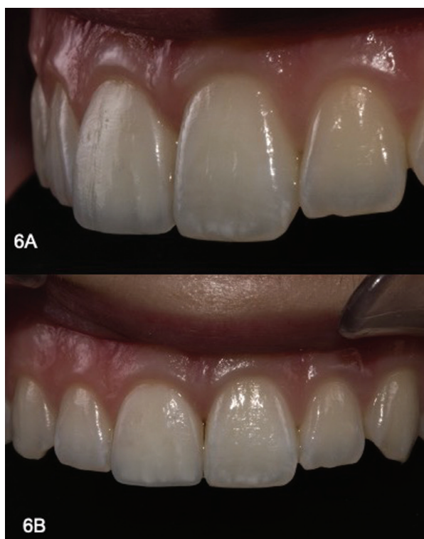
Fig. 6: Final Outcome A) Close Up B) Smile

ments. A fine grit diamond bur (864 014 12F, Komet) was also used to create micro-texture. Restoration was polished using a fine and extra fine polishing discs (Sof-Lex 3M, ESPE) from medium to superfine for marginal ridges, and special polishers (Eve Diacomp Plus Twist polishers, Stuttgart, Germany) for the facial and lingual. Final luster was achieved using a system of diamond and silicon carbide-based pastes (Enamel Plus Hfo Polishing Paste Kit, Micerium, Genova, Italy) applied by 3 different goat hair brushes and a felt wheel without paste at the end. Final esthetic evaluation, including shade and texture, was performed 14 days postoperatively (Fig. 6).