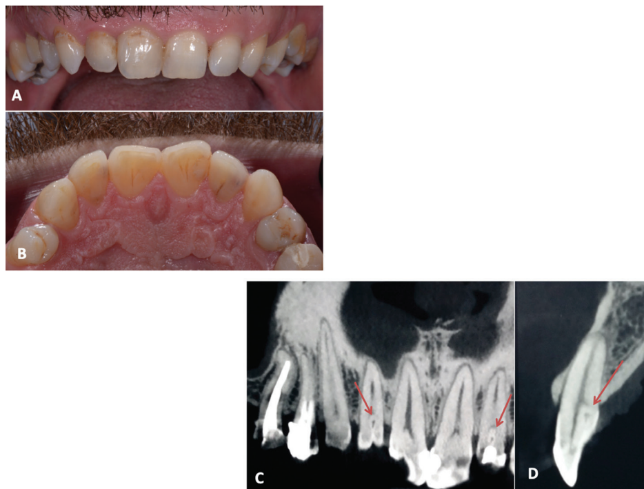
Fig. 2: Photographic buccal (A) and palatal (B) view of maxillary teeth. CBCT images (C. frontal view, D. sagittal view) of maxillary teeth. The internal structure is characteristic of a dens invaginatus type II (Ohler's classification).