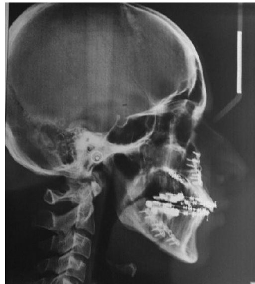
Fig. 2: Post-surgical lateral cephalogram.

Lateral cephalograms of 34 individuals who had reported to the department of orthodontics for the treatment of class III malocclusions were selected from the archive. In both the group, lateral cephalograms were taken at 3 intervals, pre treatment (C1) (Fig. 1), post surgical (C2) (Fig. 2), and post orthodontic treatment (C3) (Fig. 3). Radiographs of all patients were taken in the upright position with the Frankfort horizontal line parallel to the floor, tongue and lips in relaxed position, and jaws in habitual occlusion.