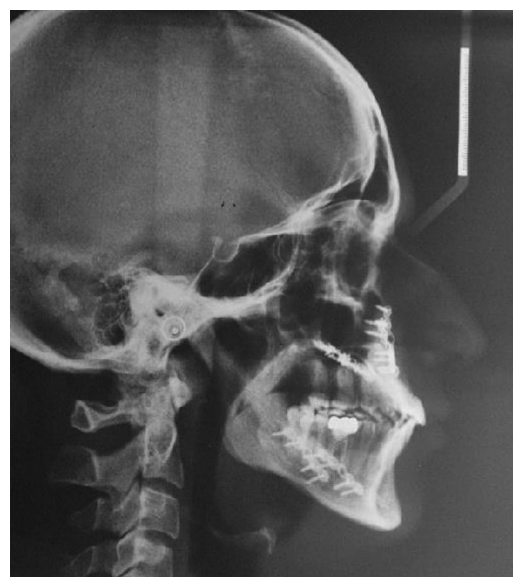
Fig. 3: Post-orthodontic lateral cephalogram.