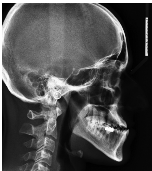
Fig. 1: Pre-orthodontic lateral cephalogram.