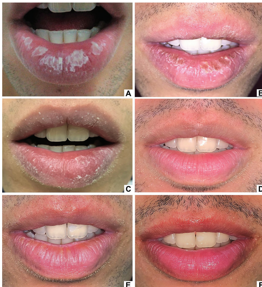
Fig. 1: Clinical aspects of Case 1. White plaques on the lower lip (A). Yellowish-white crusts on the upper and lower lips (B). Improvement of the clinical appearance after using topical corticosteroids (C). Complete resolution of the lesions on the upper and lower lips after using corticosteroids (D). Recurrence of the lesions: yellowish crusts and dryness of the lower lip (E). Remission of lesions on the lips after a new drug intervention (F).

During the anamnesis, the patient reported that the le-