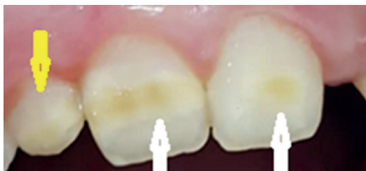
Fig. 2: The MIH on the permanent upper central incisors of a 9 years old girl in the CD group (white arrows). An enamel defect was also indicated on the right upper lateral incisor (yellow arrow) however the tooth was not within the scope of MIH investigation.

Permanent central incisors were also evaluated (Fig. 2).