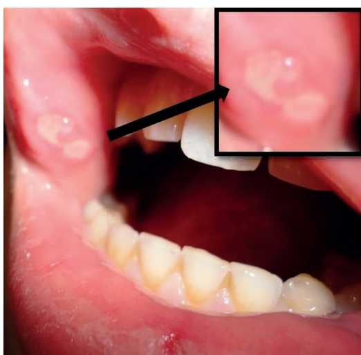
Fig. 3: RAUs on the right buccal mucosa of a 14-year-old boy with poor oral hygiene in the CD group. A black arrow indicated the aphthous lesion.

To determine the caries experience of each child, DMFS (the sum of the number of Decayed, Missing due to caries, and Filled tooth Surfaces in the permanent teeth) and dfs (the sum of the number of decayed, and filled tooth surfaces in the primary teeth) index were used by a previously calibrated pediatric dentist (12). The same examiner examined the soft tissues for the diagnosis of RAU as shown in Fig. 3 (present or not) and the patient's parents were also questioned about the recurrent occurrence of oral ulcers.