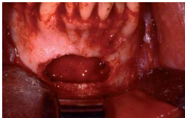
Fig. 2. Surgical approach to a traumatic bone cyst located in the region of the chin symphysis. The cavity of the lesion is seen to be vacant.