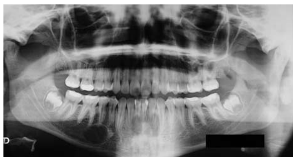
Fig. 1. Panoramic X-ray view. Traumatic bone cyst located in the region of the right lower second premolar.