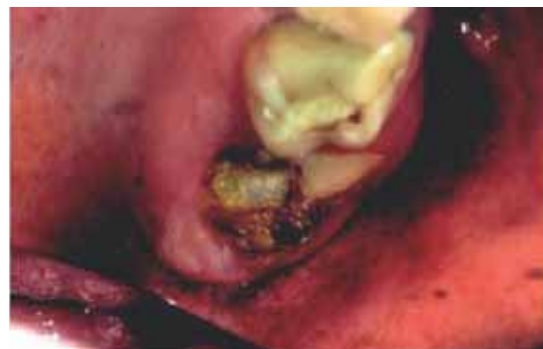
Fig. 2 Intraoral view showing partial eruption of 2.7 (mesial cuspids). Also seen is the distal partial eruption of the lesion (Case 2).