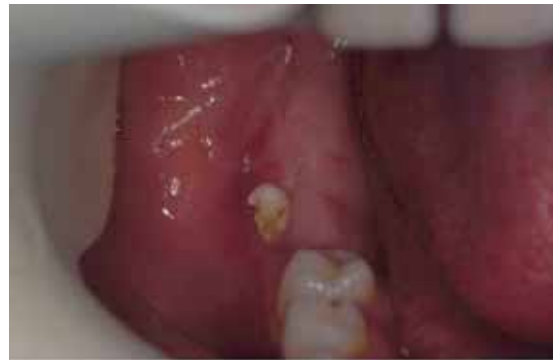
Fig. 1 Intraoral view showing eruption of a fragment of the lesion in the region of the lower right second molar. In addition, 4.6 is seen to be missing (Case 1).

The treatment consisted of surgical removal of the lesion, followed by histopathological study, which confirmed the diagnosis of complex odontoma. Relocation of 4.6 was carried out in the same surgical step. Clinical and radiological controls were made, and after 8 months the first molar finally reached the occlusal plane without the need for orthodontic traction.