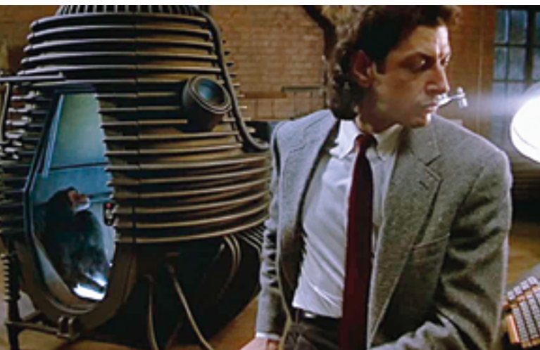
The film The fly (1986), by David Cronenberg, focuses on the scientist and his metamorphosis, which he himself perceives as an opportunity to improve the human species.