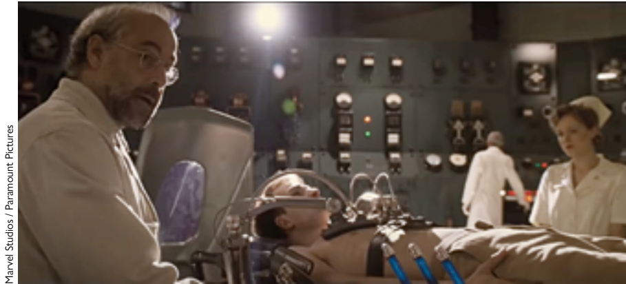
Marvel Studios / Paramount Pictures