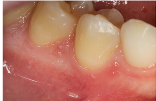
Fig. 1: Clinical appearance of the lymphatic malformation. An elevated lesion consisting of multiple vesicles with a translucent and slightly erythematous colouration is recognisable.

With all these data, lymphatic malformation was our