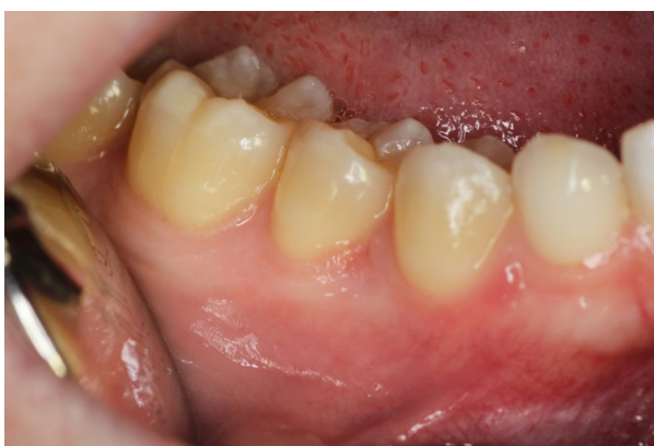
Fig. 4: Clinical appearance 7 days after surgery.

At the 7 days follow-up, adequate healing was observed, with no functional alterations (Fig. 4). No recurrence of the lesion has been noted at 6 months follow up.