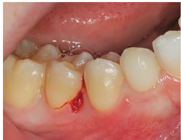
Fig. 2: Surgical bed after lesion removal.

Given the clinical characteristics of the lesion, it was decided to perform its removal and subsequent histopathological analysis. Under infiltrative anaesthesia using 4% articaine with 1:100.000 adrenaline and with a No. 3 scalpel and No. 15 blade, surgical exeresis was performed, leaving the surgical bed healing by secondary intention (Fig. 2).