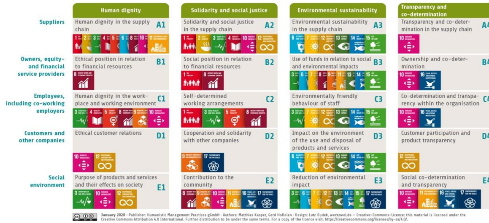
Figure. 2. The Common Good Matrix (CGM).