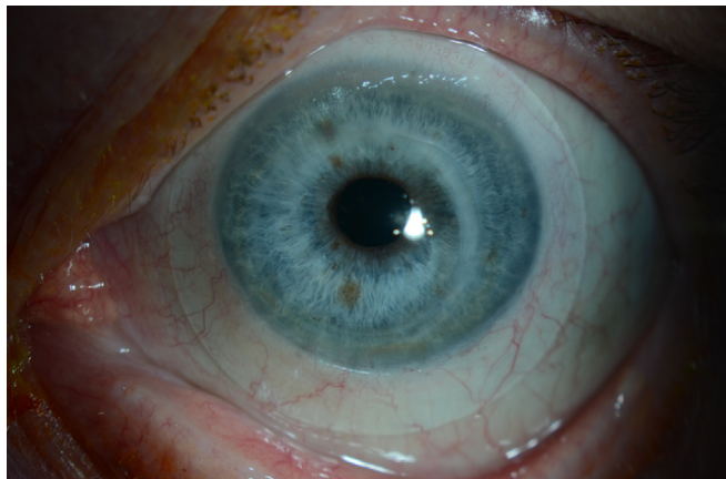
Figure 1: A mini-scleral contact lens fitted after keratoplasty surgery in this study.

Table 1 shows the demographic and clinical data of the twenty-two post-keratoplasty eyes. The mean \pm SD age of the sixteen Caucasian males and six Caucasian females was 48.82 \pm 17.19 years (range 19 to 74 years). All patients underwent keratoplasty in only eye, keratoconus being the main indication, followed by corneal opacities or corneal scars and Fuchs endothelial dystrophy (Table 2). After keratoplasty, high refractive anisometropia was found in fourteen patients (63.6%), and they all had prolate corneas, except three cases (oblate cornea). Moreover, six eyes presented significant irregular astigmatism and/or abnormal corneal profiles; hence, it was difficult to determine refractive status. The mean logMAR visual acuity before keratoplasty was 0.77 \pm 0.22 . After keratoplasty, logMAR visual acuity